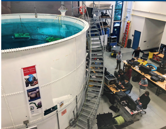
Indoor training facility at NMC.

The Water Quality and Environmental Technology program is designed to train the growing workforce needed to restore and remediate environmentally-compromised sites, focused on groundwater across the state of Michigan, throughout the Great Lakes region, and the U.S.