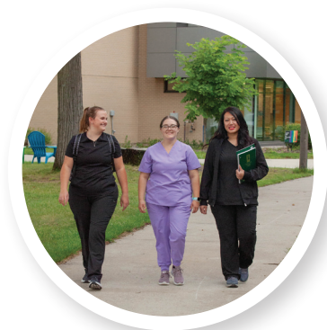
Small class sizes provide help & support. The program takes up to 24 students per semester