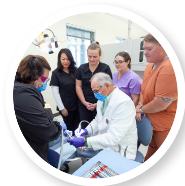
Dedicated dental lab at NMC's Front Street Campus Health & Science Building

Graduating from an accredited program makes students eligible to sit for the RDA state board exam and become a registered dental assistant with more earning potential.