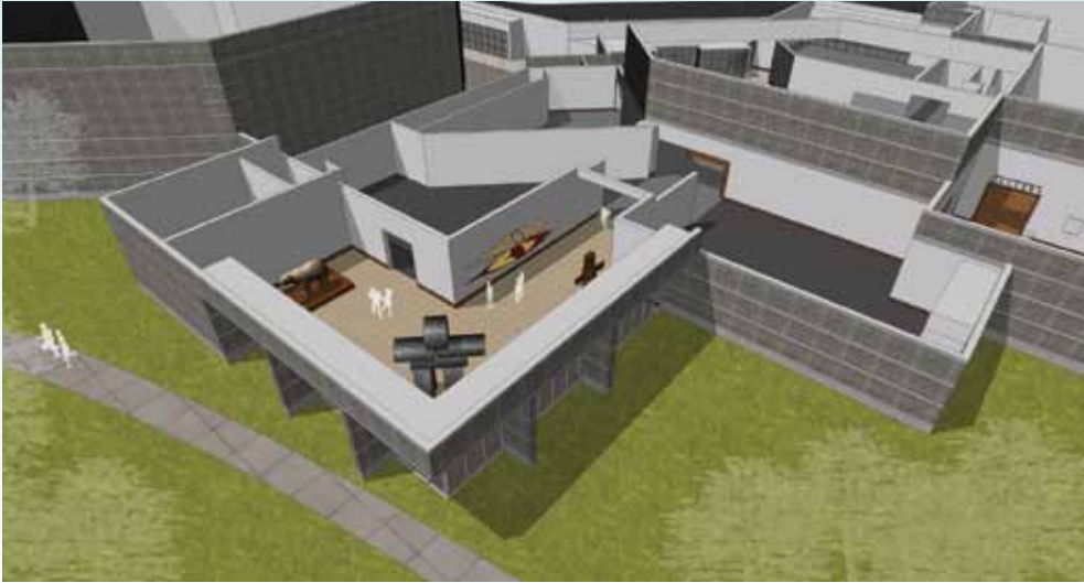
This drawing shows an aerial perspective of the expanded Inuit Gallery at the Denmos Museum Center.

The entire expansion project is targeted for bid in early 2016, with groundbreaking later this year.