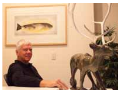
Dennos Inuit art gallery to expand. p. 5.