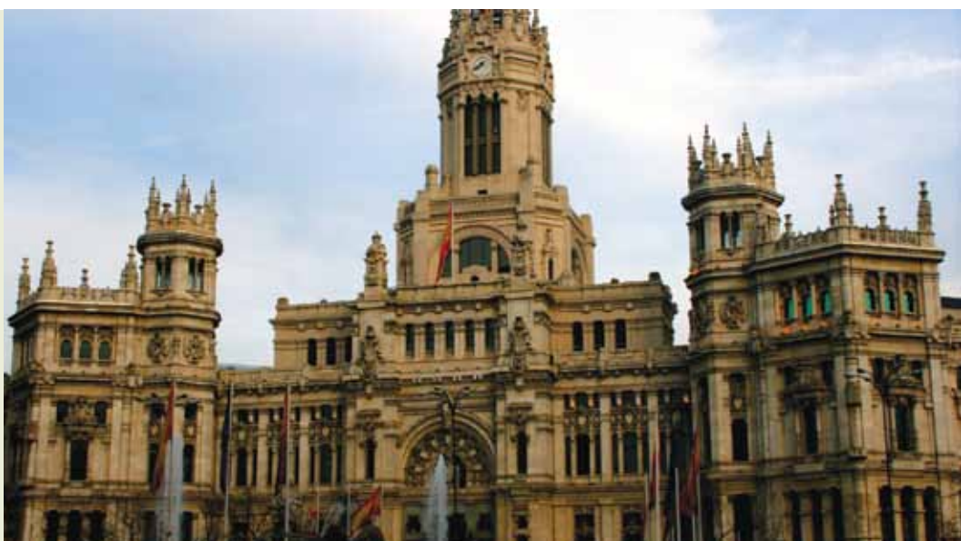
The Palacio de Cibeles, a landmark in Madrid, Spain.

► Find out more at nmc.edu/ees or call (231) 995-1705.