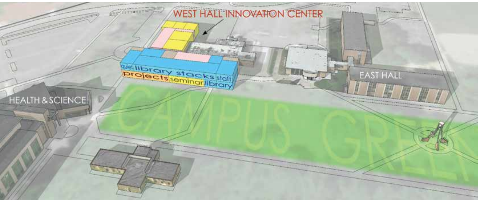
NEW WEST HALL INNOVATION CENTER