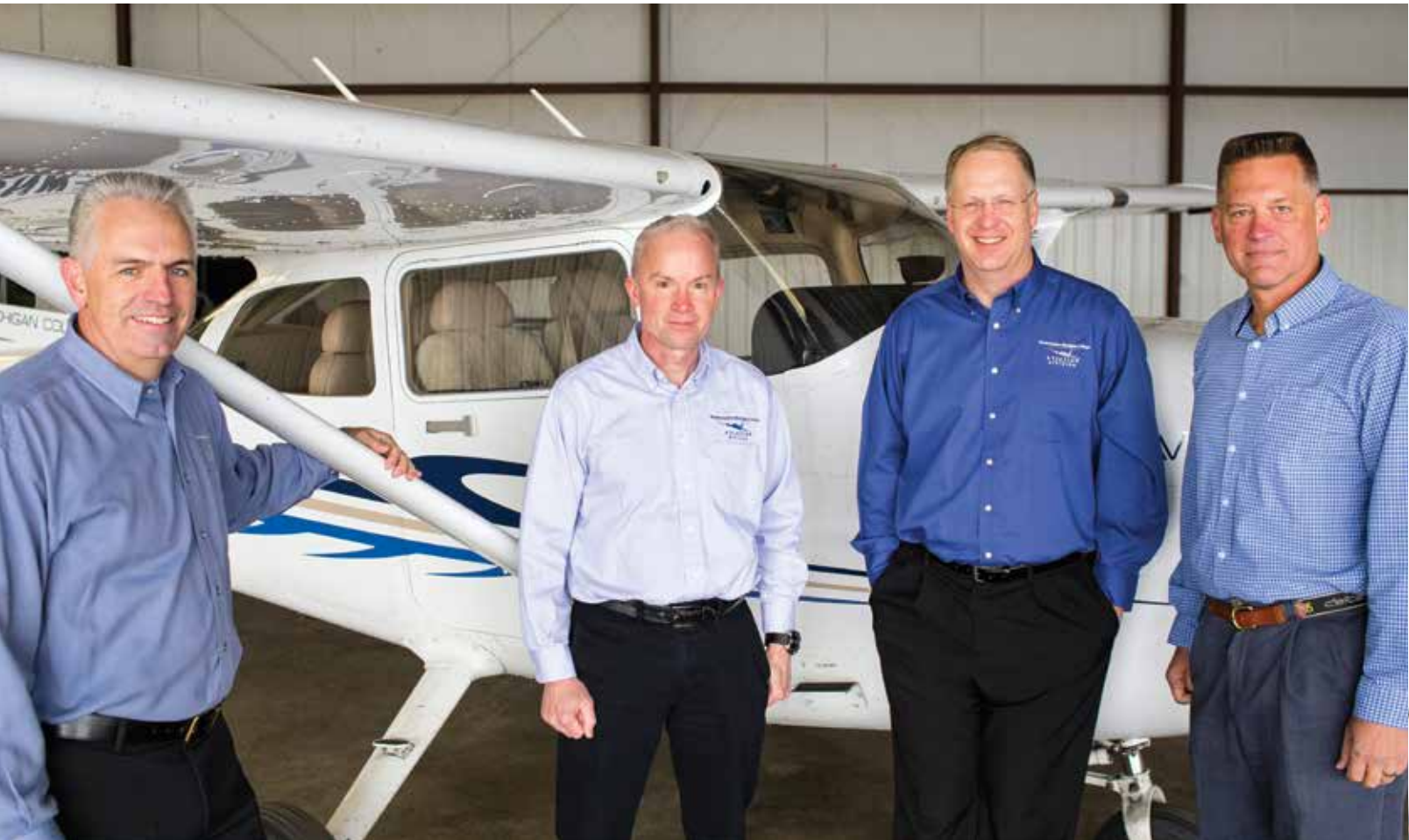
THE FOURSOME BRINGS 90 YEARS OF MILITARY FLYING EXPERIENCE