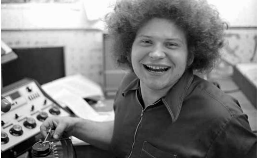
BOB SEGER (YES, THE BOB SEGER!)