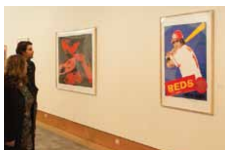
The Dennonos receives Andy Warhol prints, on display through April 5. See p. 4.