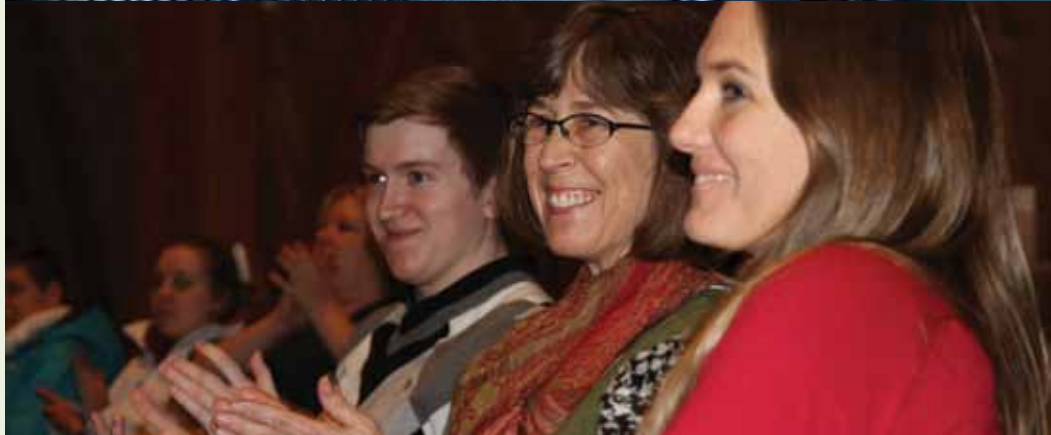
Top, Audio Technology students work in their lab. Above, Anatomy and Physiology students applaud the pieces created for a collaborative project called "Body of Music."