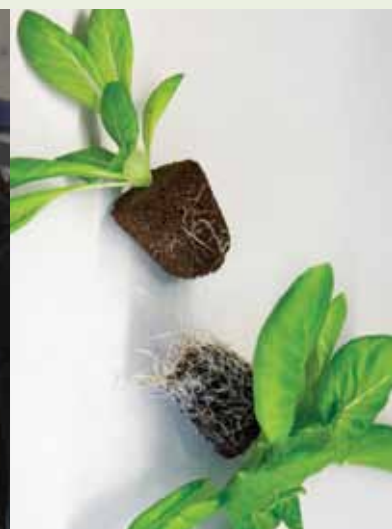
At left, NMC student Tanner Ciganic monitors hydroponically grown bibb lettuce. At right, both plants are three weeks old and illustrate how water scarcity affects root system development.