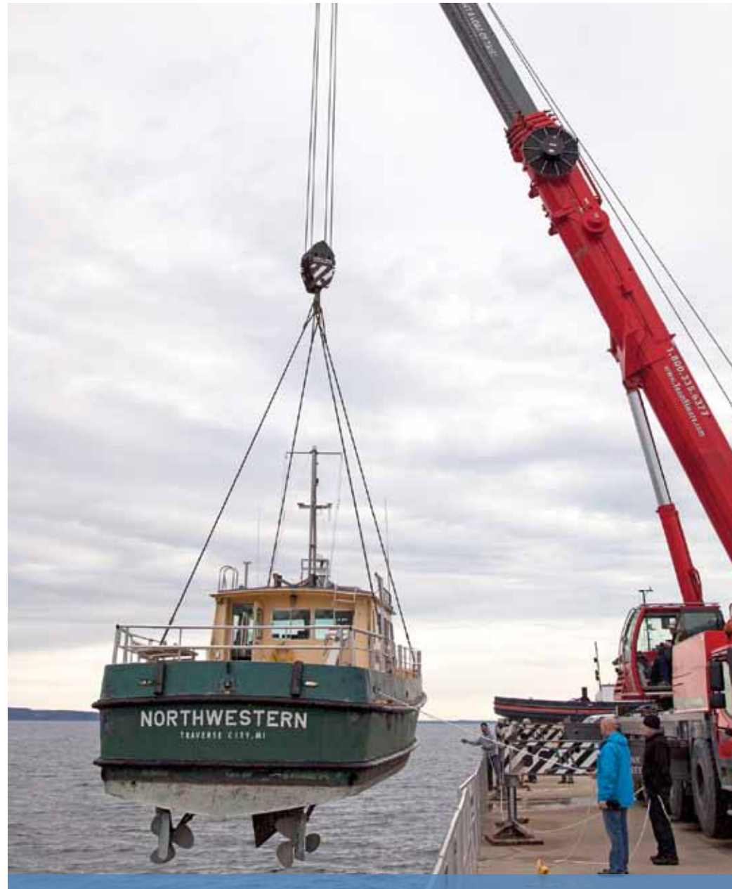
Students from around the nation and world will study aboard NMC vessels this summer.

Looking from blue bay to blue skies, this summer NMC Aviation will be joined by 37 international flight students, the largest contingent to date.