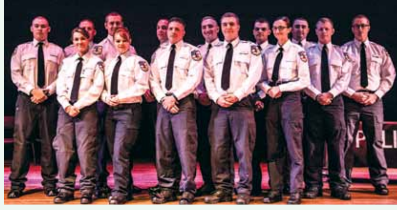
NMC's Police Academy Class of 2016 at their graduation ceremony.