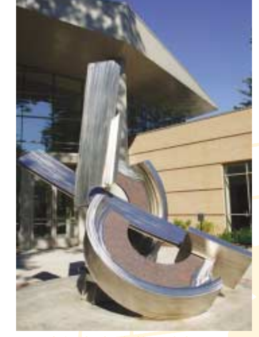
Nexus , designed and crafted by NMC alumnae Sally Rogers.

Public art has become an integral part of NMC's environment, with eleven different pieces of outdoor art on campus each communicating a personality of its own. Some of these beacons are prominent,