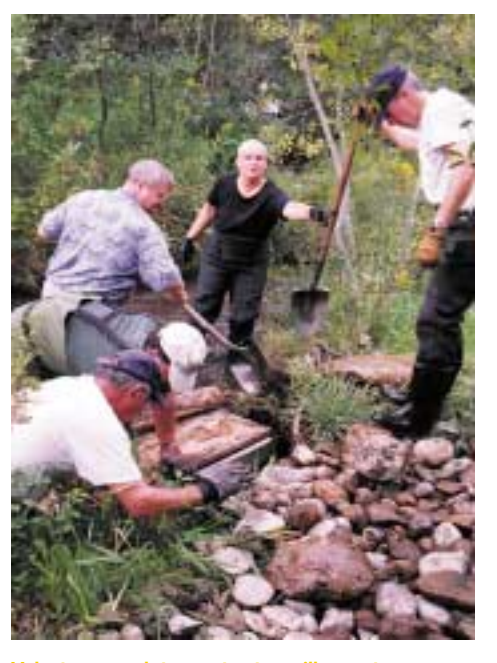
Volunteers work to construct a spillway at Kid's Creek.

The restoration effort was the result of a partnership with the members of Traverse City Rotary Clubs, NMC's Water Studies Institute, the Grand Traverse Bay Watershed Center and Grand Traverse Conservation District's Boardman River Project. Members of these groups got their hands and feet dirty for the Kid's Creek Restoration Project, one of several initiatives sponsored by the Alliance for Great Lakes Stewardship. This restoration effort was made possible by a $1 million grant from the Rotary Charities of Traverse City to NMC's Water Studies Institute last February.