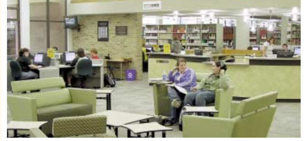
The newly designed Osterlin lobby conveys a sophisticated retro feeling.

After touring the new Osterlin building, one can see that the changes will benefit students, faculty and other users who access the resources available here for many years to come.