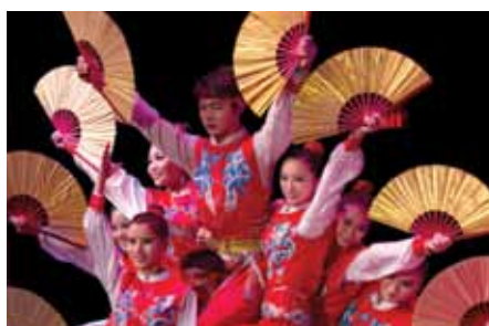
The Golden Dragon Acrobats return to Milliken Auditorium Oct. 12. See p. 4.

Light years distant of the furthest galaxies visible through the telescope at NMC's Rogers Observatory. (SEE FOR YOURSELF AT THE NEXT PUBLIC VIEWING NIGHTS OCT. 5 AND 20)