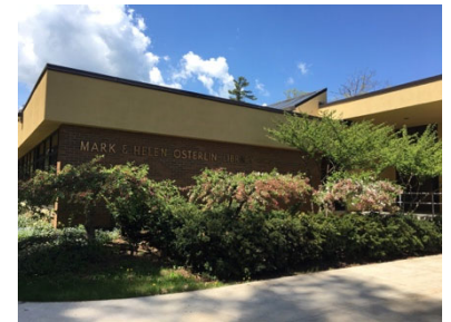
Osterlin Building – SE Exterior