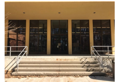
Osterlin Building – Main Entrance