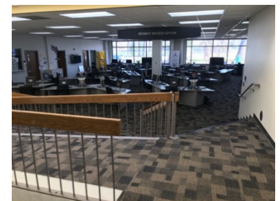
Osterlin Building – Student Success Ctr