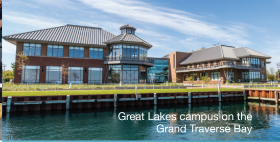
Great Lakes campus on the Grand Traverse Bay