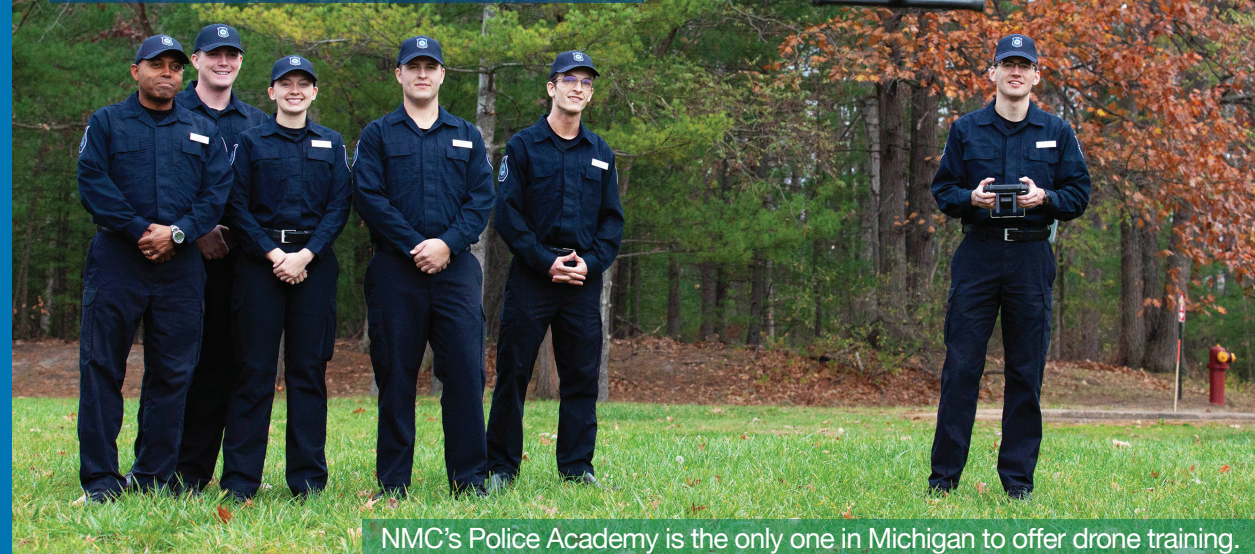
NMC's Police Academy is the only one in Michigan to offer drone training.